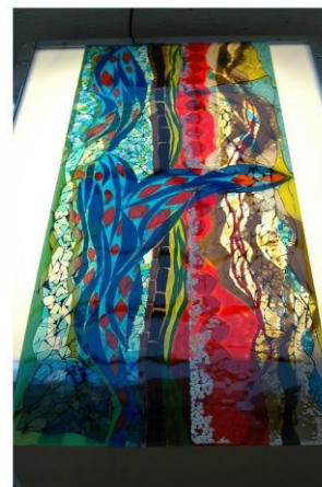
Panel #3 with second layer 22" x 46"

This course will introduce those with a working knowledge of glass fusing and forming to a more advanced methodology of flat casting using a 3D effect to display texture, imagery and pattern in, on and through their kiln glass projects.